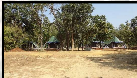
Kuldiha Wildlife Sanctuary