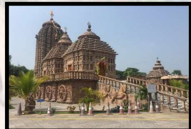
Nilgiri Jagannath Temple