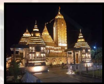
Emami Jagannath Temple