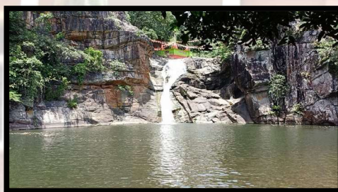
Sree Panchalingeswar Temple